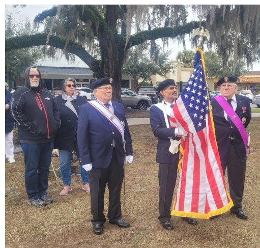
Opening ceremony with the Assembly Honor Guard