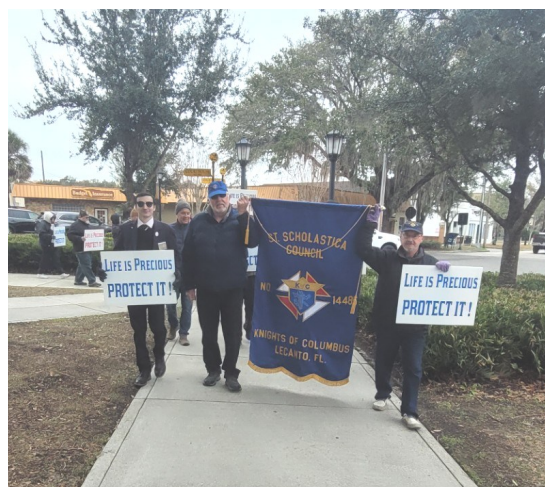
March around the Court House

On a cold January 22, 2025, Council members and other Knights gathered at Courthouse Square in Inverness for the 52nd Anniversary Roe v. Wade Memorial Service.